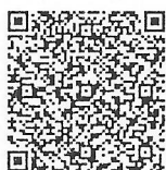
Registrar Pharmacy Council